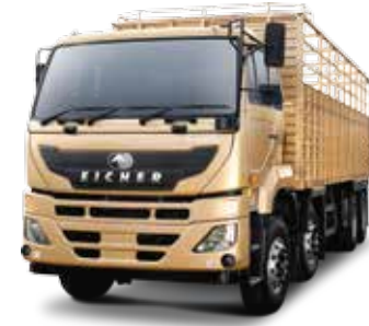
Eicher Pro 6031