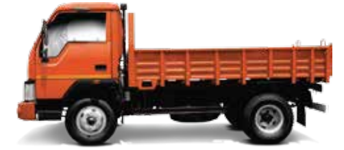
Eicher Pro 1055