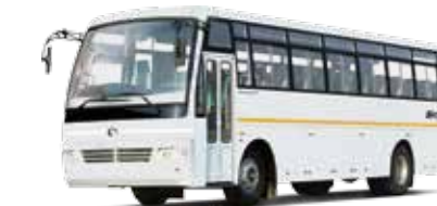
Eicher Skyline 20.15 (57+1 and 62+1 HHR Seats)