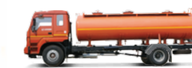
Eicher Pro 5016