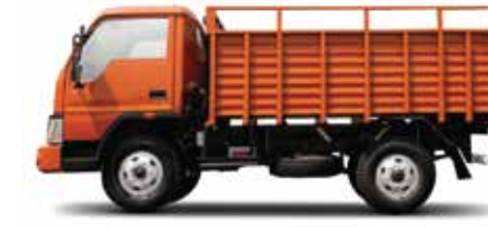
Eicher Pro 1059