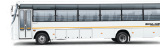
Eicher Skyline Pro 3009 (44+1 HHR Seats)