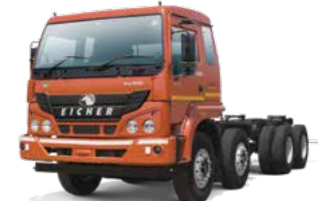
Eicher Pro 5031