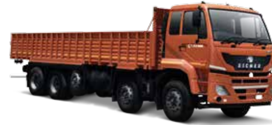
Eicher Pro 6037