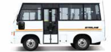
Eicher Starline 10.50 C (15+1+1 HHR Seats)