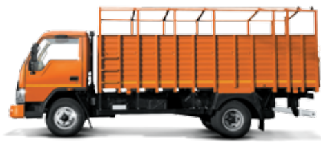
Eicher Pro 1095