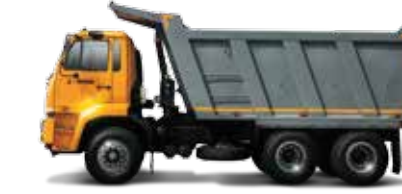
Eicher Pro 6025T FE