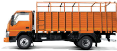
Eicher Pro 1095XP