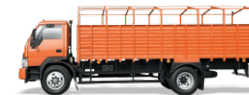
Eicher Pro 1110