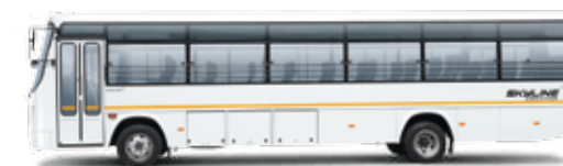
Eicher Skyline Pro 3008 (36+1 HHR Seats)