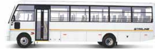
Eicher Starline 10.90 L (39+1+1 HHR Seats)