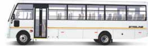
Eicher Starline 10.75 H (31+1+1 HHR Seats)