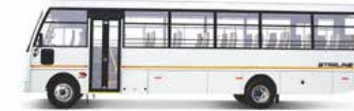
Eicher Starline 10.75 E (23+1+1 HHR Seats)

Chassis version also available in all the bus variants.