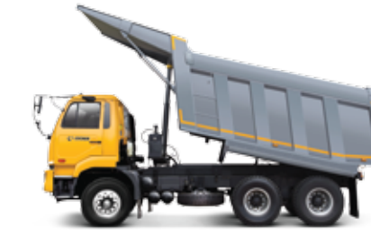
Eicher Pro 6025T