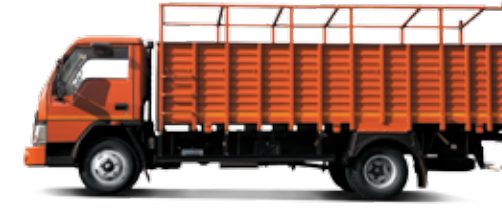
Eicher Pro 1075

Along with a completely new Pegasus front look styling across the product family, the new range of vehicles is a quantum leap in each and every aspect of exterior design, engine technology and cabin features.