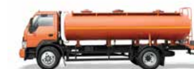
Eicher Pro 1110