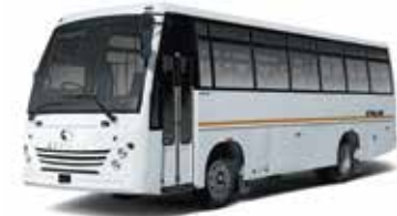
Eicher Starline 12.12 K (50+1 HHR Seats)