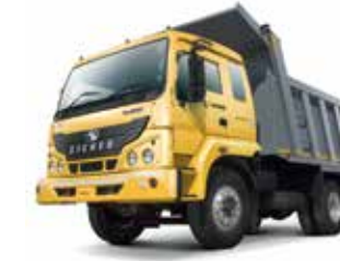
Eicher Pro 5016T

Along with a completely new Pegasus front look styling across the product family, the new range of vehicles is a quantum leap in each and every aspect of exterior design, engine technology and cabin features.