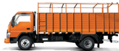
Eicher Pro 1090