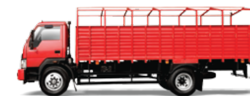
Eicher Pro 1110XP