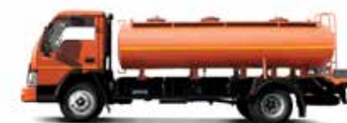
Eicher Pro 1075