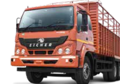
Eicher Pro 5025