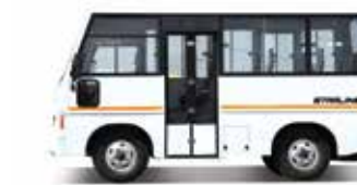
Eicher Starline 10.50 E (19+1+1 HHR Seats)