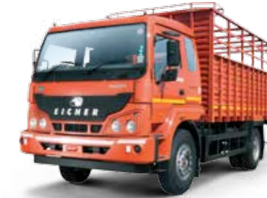
Eicher Pro 5016