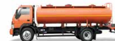
Eicher Pro 1090