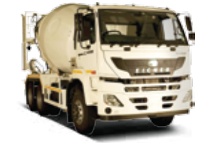
Eicher Pro 6025T TM