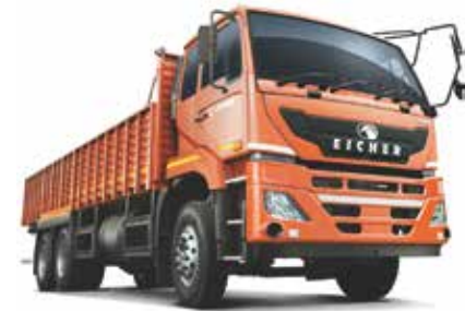
Eicher Pro 6025